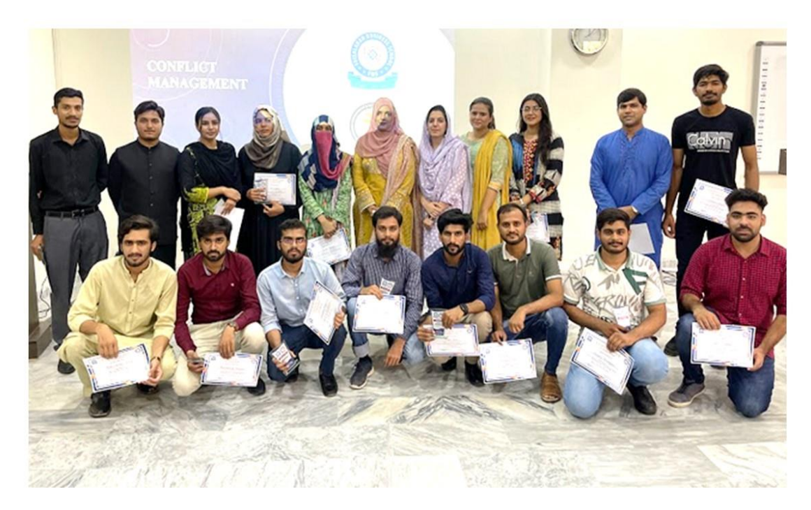
Event : Presents a workshop on presentation skills